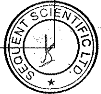
Table III - Statement showing shareholding pattern of the Public shareholder